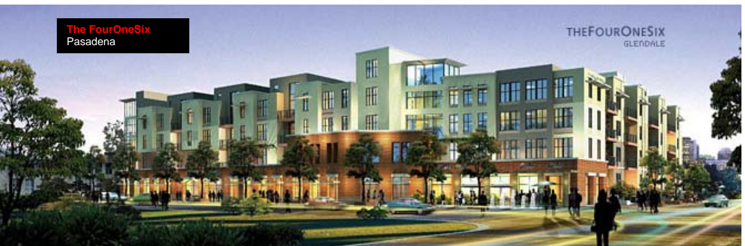
The FourOneSix Pasadena