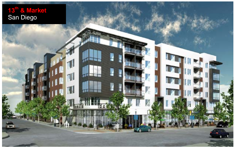
13 th & Market San Diego