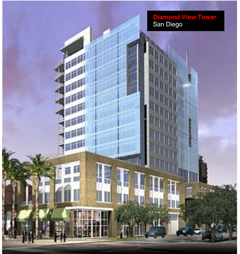
Diamond View Tower San Diego