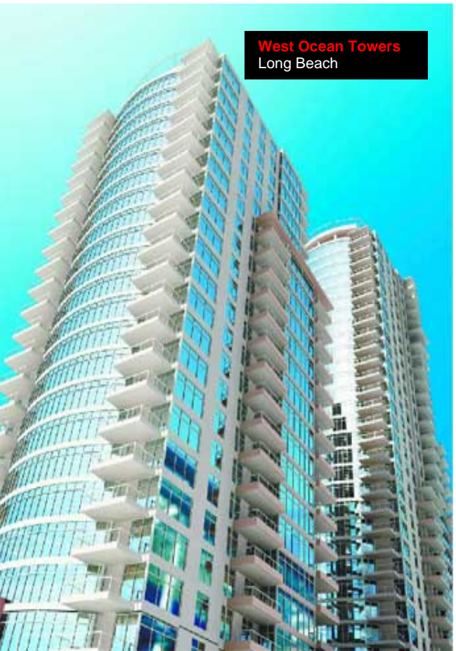
West Ocean Towers Long Beach